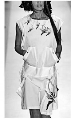
Fig. 4 Design idea that applies the extracted pattern on a dress