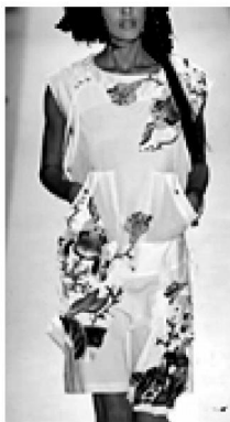
Fig.10 Traditional decorative parts on the Daur clothing