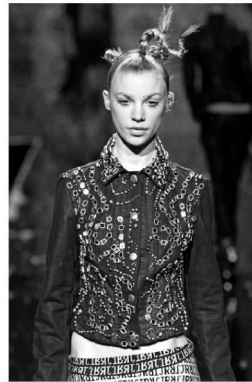
Fig.11 JOHN RICHMOND 2005 Autumn and Winter Collection (Decorated with bronze slices)

As a result, in the modern fashion design, the embroidery with silk thread is still a major method, but many name-brand clothes have begun to change materials, using such new materials as glittering slices, rhinestone, beads, metal, imitation stone and shell to replace the silk thread, which has achieved new visual effects (Figs. 11 and 12 ). We can also try to use the Daur clothing decorative pattern on the modern fashion design with this method.