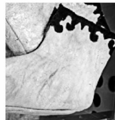
Fig. 5 Patched wool decoration on the Daur leather sock

The above-mentioned are selected decorative details from the Daur clothing, which we have tried to combine with the modern fashion design and acquire new inspiration. As a matter of fact, in the long history of the Daur clothing culture, there are many things to be discovered and used in the modern clothing. We should make in-depth exploration, research, and consideration on how to fully combine both together.