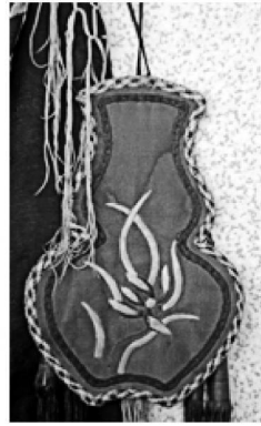
Fig. 3 Embroidery on the Daur tobacco pouch

In the traditional decorative line patterns, the method of "dispersing and reorganizing" was used in ancient China. The so-called "dispersing" means to disintegrate or shift the original pattern structure and matching method, break up the original structural organization, and extract the most typical and representative elements. The so-called "reorganizing" means to reorganize the dispersed and extracted elements, and conduct necessary finishing process, in order to obtain an entirely new form that can merge into the characteristics of the original patterns. This is an important innovation of forms. In the practice of the modern innovative design of the traditional art, this traditional formation method is very useful in the modern formation design. There are many decorative patterns in the Daur patterns, including the front fly, lower hem, embroidered patterns on the cuff, rimming, and the various delicate lines on the tobacco pouch (Fig. 3). Some of them are complicated and warm, and the others are simple and bright [4] . It is important to fully analyze the structural features of their original forms in the process of dispersing, so as to ensure the relative independent and representative characteristics. It is also important to consider how to apply the traditional decorative elements into the modern fashion design in the process of reorganization (Fig. 4).