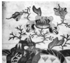
Fig.9 Daur embroidered flower pattern

The Daur people always put laces and patterns on their robes, hats, shoes and boots, gloves, and tobacco pouches. The patterns have rich colors and lines. In their traditional clothing, the decorated parts are usually the collar, cuff, front fly, lower hem, and slit [3] . We can try to break these traditional models and change the parts of decoration used on the clothing, in order to bring different visual effects to the clothing. We can borrow and change the design ideas for designing the decorative parts of the clothing, and combine the Daur clothing decorative pattern into the modern fashion design. (Figs.9 and 10).