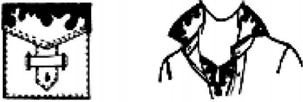
Fig.7 The decorative detail above is used on the modern fashion design