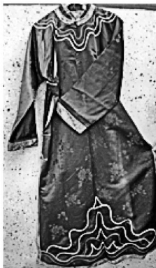
Fig.1 Daur female dress

decorations sewn on the back and finger-joints of gloves (Fig.2), and the soles of boots, which are also both for the additional beauty, and because these are the parts that are easily worn, scratched, and torn at working [2] . The beautifully embroidered rich patterns on the tobacco pouches and handkerchiefs can also play the function of reducing the wear and tear of the cloth and extend its usage.