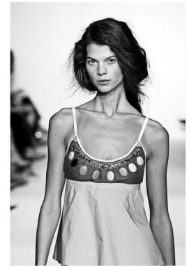
Fig.12 ARNI 2005 Spring and Summer Collection (Decorated with plastic slices)