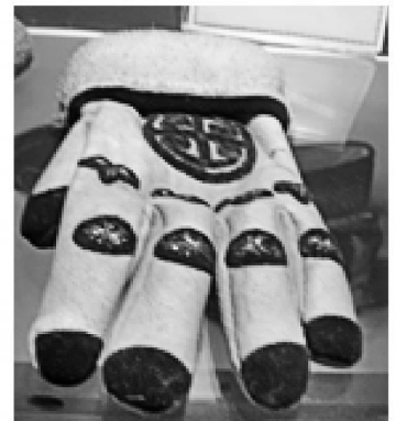
Fig.2 Daur leather glove